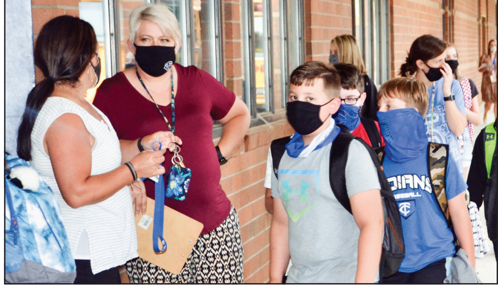
Students and teachers mask up for the first week back at Towns County Schools.

By Jarrett Whitener Towns County Herald Staff Writer