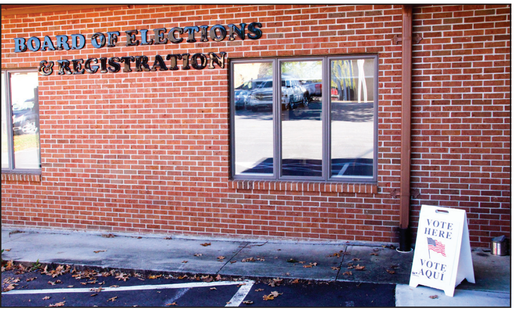
The Towns County Board of Elections & Registration is located in Suite A of 67 Lakeview Circle in Hiawassee next to the courthouse.