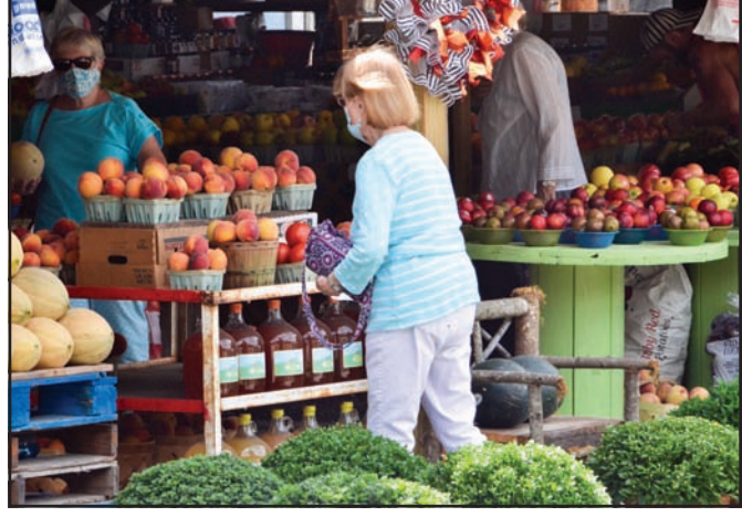
The Hiawassee Fruit & Vegetable Market is a popular destination for fresh produce during the week.

Of course, people should See Corona Concerns, Page 6A